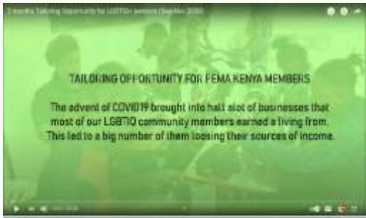
5. Tailoring opportunity for GSM Click here> https://bit.ly/386L5NU