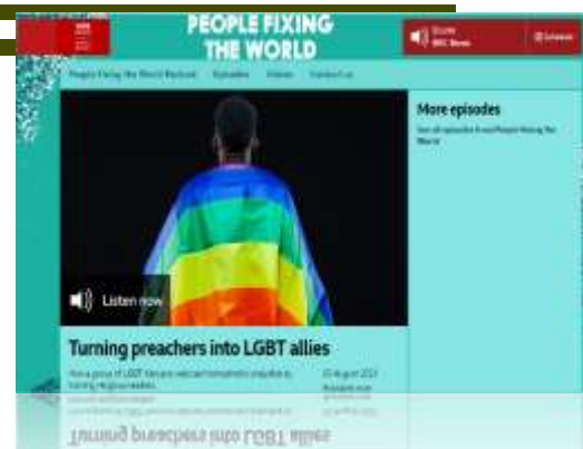
2. BBC, People Fixing The Word Click here> https://bbc.in/3B1JaGT