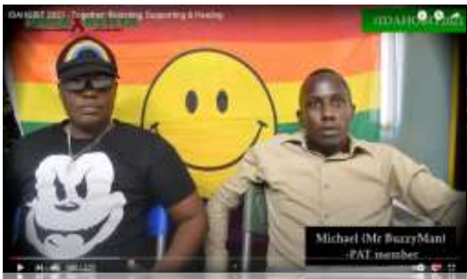
4. IDAHOBIT2021 Click here> https://bit.ly/3yc3Xpk