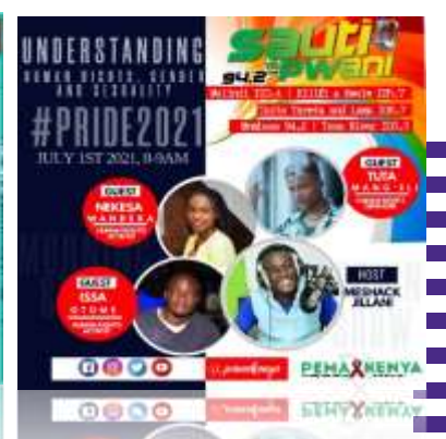
3. Radio Talk Show Click here> https://bit.ly/3B2Obz8